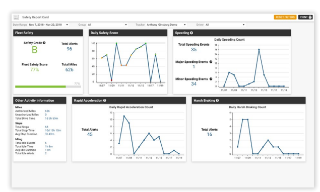
Safety Report Card

Alerts: A fleet-wide look at all Alerts that have been generated. On this report you can sort by specific Alert, such as Speeding, to highlight areas that are important for you to monitor.