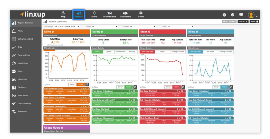
Reports Dashboard: An overview of your vehicle habits and activity in a consolidated format